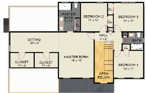
Upper Level 1,340 sq. ft.